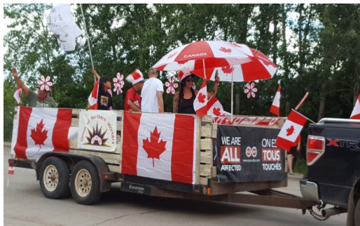
Local 2 participated in the annual Canada Day Parade in Fort Smith on 1 July, 2018